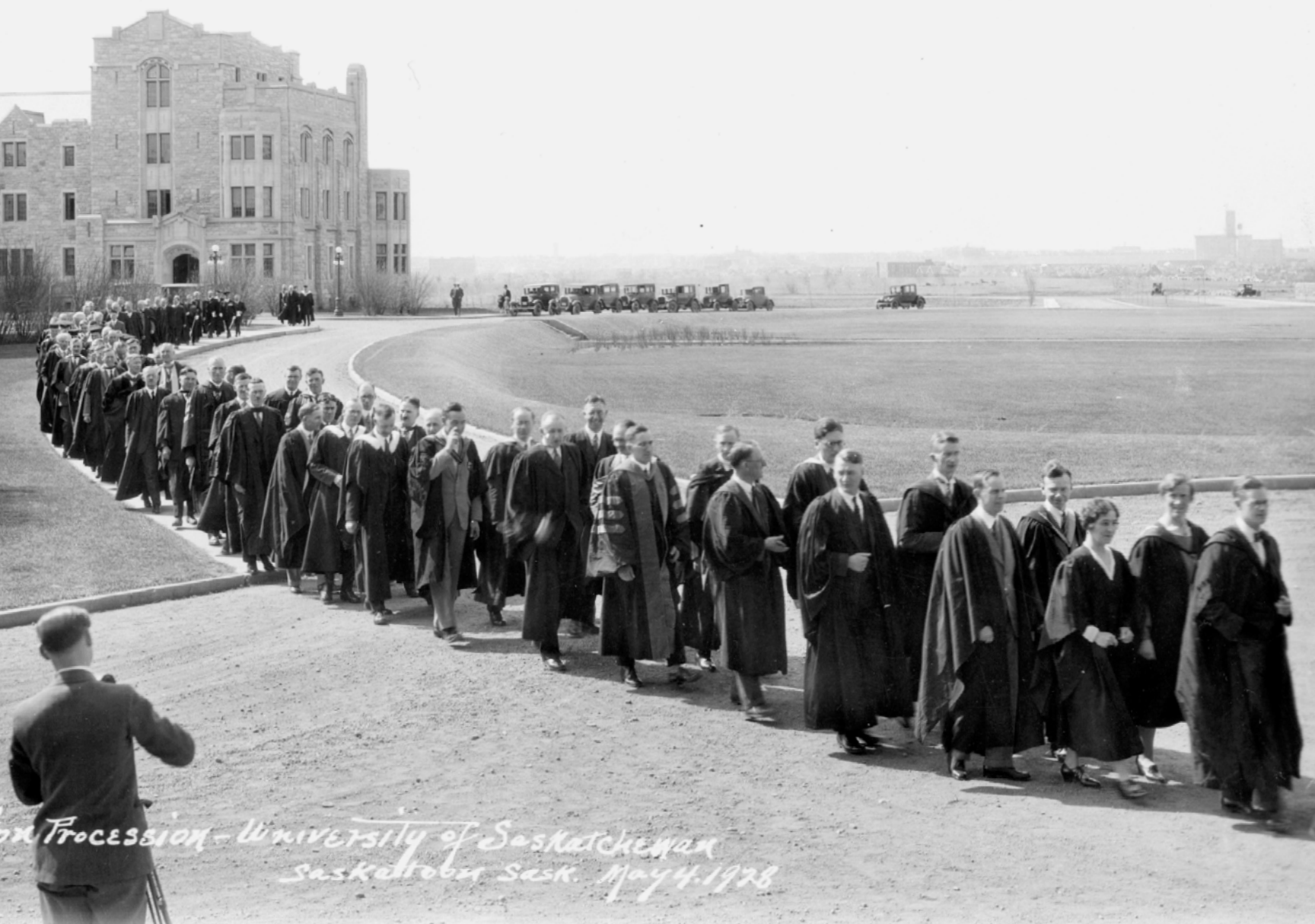
Convocation procession in the Bowl, May 1928. A-1666

PROCESSION - University of Saskatchewan Saskatoon Sask. May 4, 1928